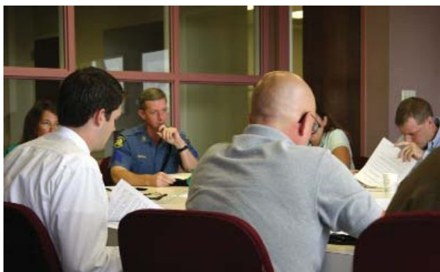
Figure 1. 2006 Destination: Safe Coalition Meeting

Destination: Safe is guiding the development of a regional transportation safety plan. An early version of this plan, or blueprint, is contained in the Safety Element of the