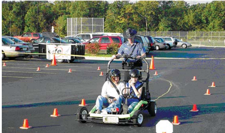
Figure 2. Impaired Driving Simulation Vehicle

Support from local officials and local decision-makers make Destination: Safe possible and keep safety a high priority in the region.